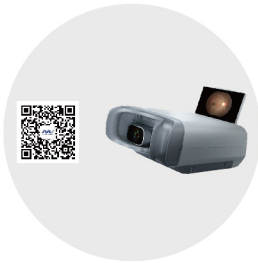
Scan the QR code, system will align pupil and start capture

FC162 captures binocular fundus images in a fully automatic way( auto alignment, auto focus, auto voice interaction). Generate AI diagnosis report(supported by 3rd party case screening system) to analyze multiple retinal diseases, diabetes, cardiovascular and neurological diseases (such as brain tumors, anemia, etc.). Only 2 mins needed to capture images and get report, super smart solution for early detection and intervention for various diseases.