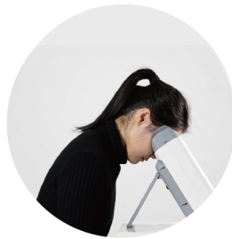
Capture binocular retina images under voice interaction